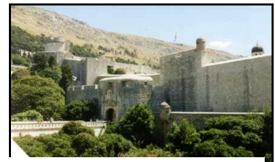
The Pile Gate, Dubrovnik