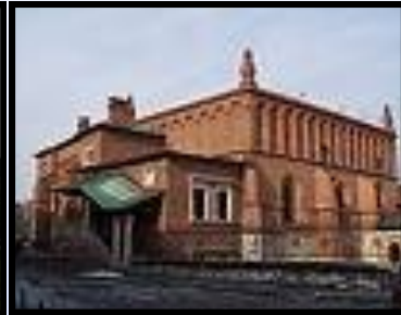
The Old Synagogue