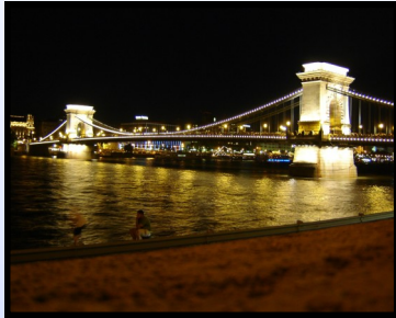
The Chain Bridge