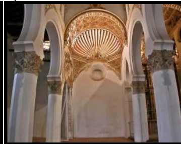
Synagogue la Blanca